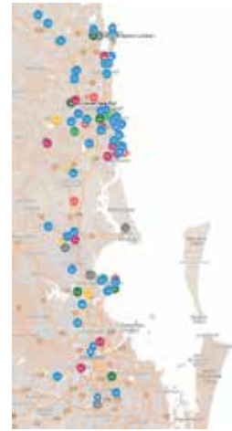
RoboCoast workshop venues and participating schools